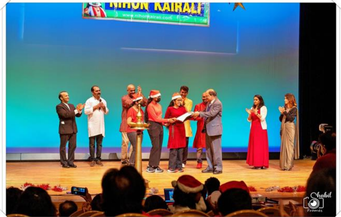
Handing over NPO certificate to community