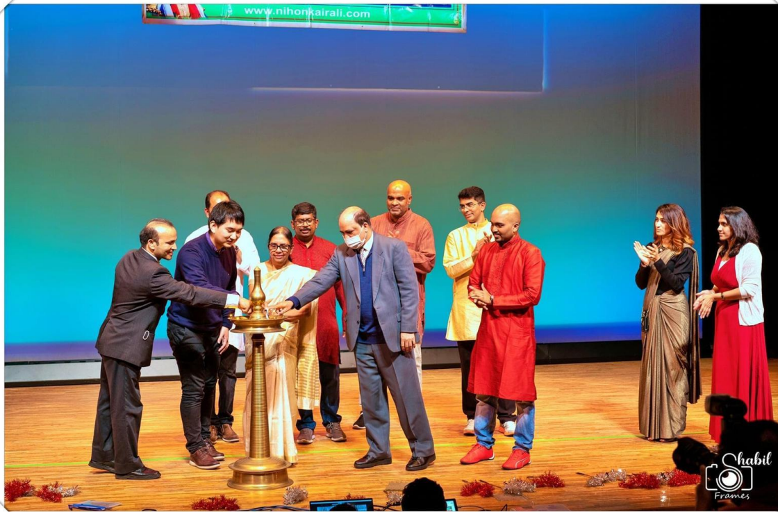
Lighting the lamp for the new NPO